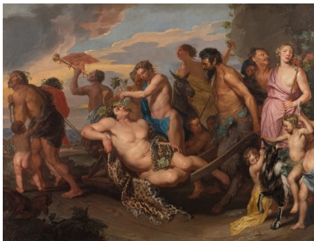
Michaelina Wautier Bacchanal before 1659 Kunsthistorisches Museum, Picture Gallery

Press photographs are available in the press section of our website free of charge, for your topical reporting: press.khm.at/en