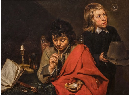
Michaelina Wautier Boys Blowing Bubbles 1640s Oil on canvas, 90.5 x 121.3 cm Gift of Mr. Floyd Naramore, 58.140 Seattle Art Museum