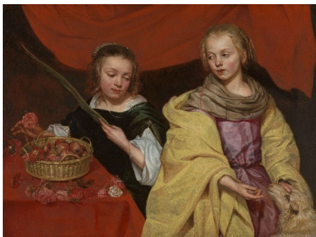
Michaelina Wautier Two Girls as Saint Agnes and Saint Dorothy Leinwand, 89,7 × 122 cm Royal Museum of Fine Arts Antwerp - Flemish Community